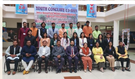
26<sup>th</sup> February 2023- The 7th Edition of National Moot Court Competition of Law College Dehradun witnessed